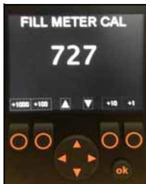
Fill Meter Cal Screen

Screen used to enter the Meter Cal value stamped on the fill flow meter. Use the buttons immediately below the screen to adjust the value.