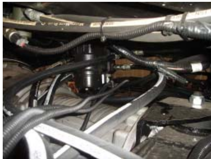
Pressure hose from pump