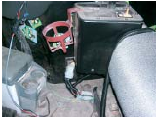
Tee Smartboom harness into armrest harness