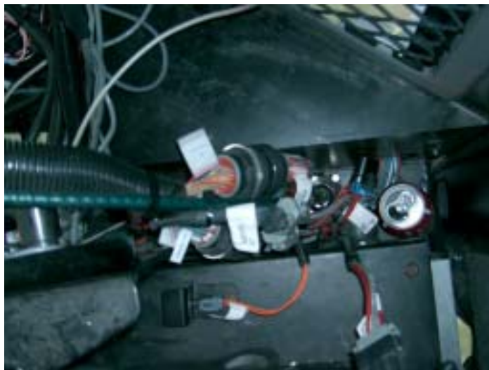
Armrest bulkhead connectors