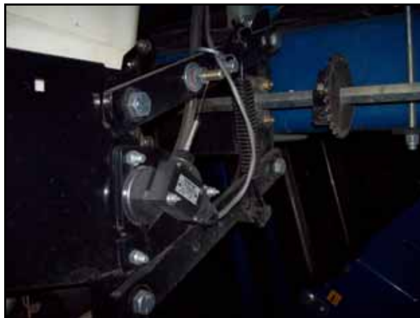
FIGURE 2. Kinze Row Unit Linkage