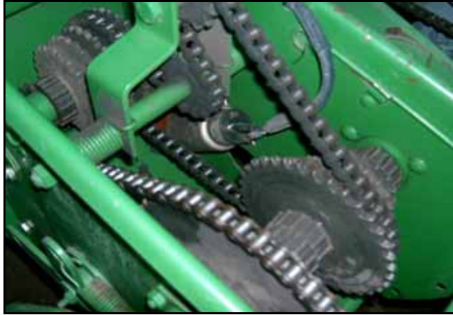
FIGURE 1. John Deere 7200 Clutch