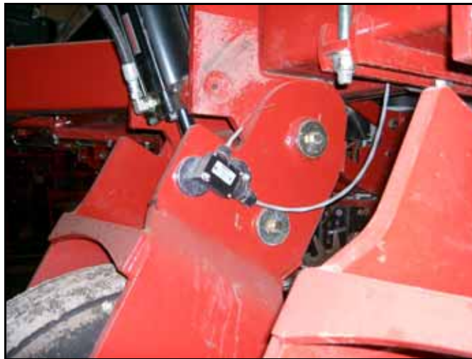
FIGURE 1. 8500 White Toolbar Cylinder Linkage