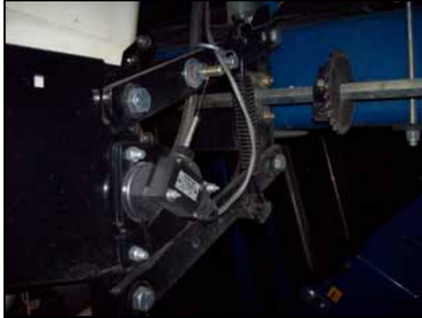
FIGURE 4. Kinze Row Unit Linkage