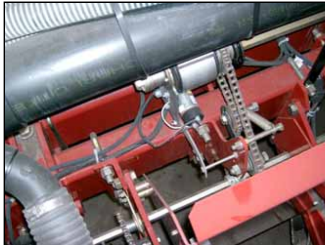
FIGURE 2. White 8500 Clutch