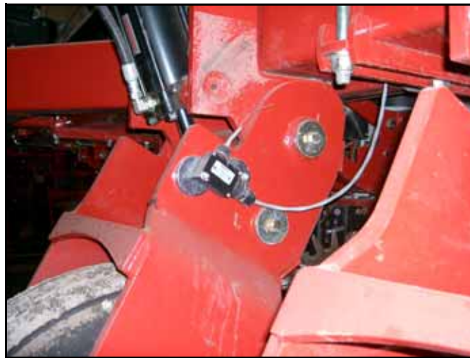
FIGURE 3. 8500 White Toolbar Cylinder Linkage