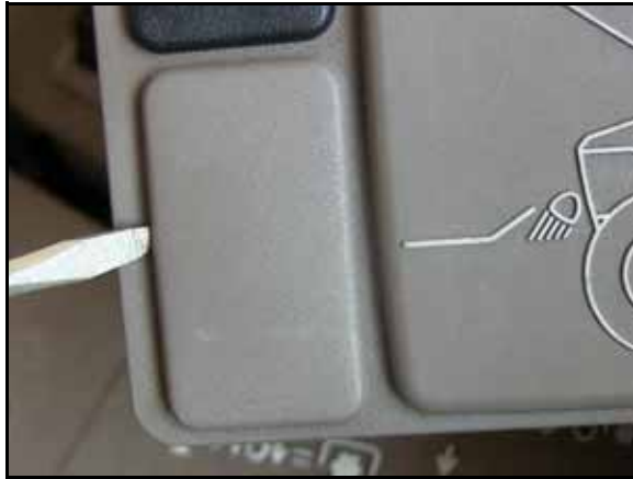
FIGURE 1. Removing Switch Port Cover