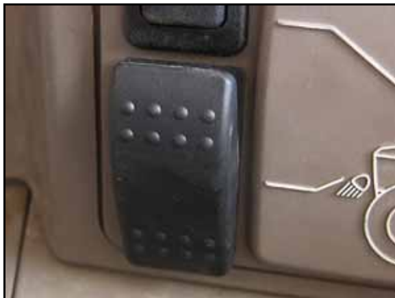
FIGURE 2. Enable Rocker Switch Installed