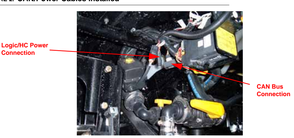
FIGURE 2. CAN/Power Cables Installed

Locate the CAN Bus terminator and CAN Bus power connector (4-pin Deutsch receptacle) under the catwalk.