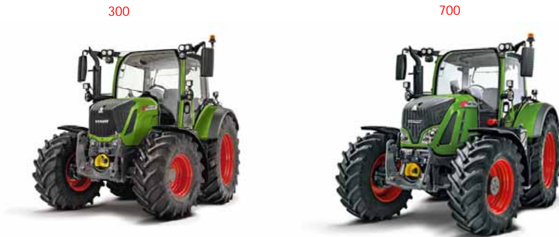
FIGURE 1. Fendt Tractors

Model. 300 Gen 4 and 700 Gen 6 - Varioguide Ready with Fendt One