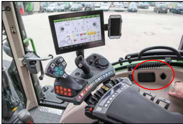
FIGURE 1. Connector Location