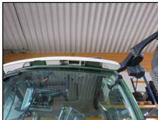
FIGURE 6. Cable Routing Location