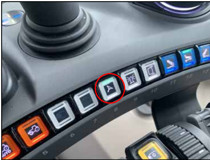
FIGURE 19. Pre-Activation on Armrest