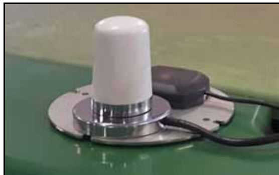
FIGURE 15. GPRS/UMTS Mounted

Connect the power cable to the connector with the label "Slingshot PWR." Then connect the RTK IN connector with the GPS OUT connector. Next, connect the Serial RTK IN with the Slingshot. Finally, connect the Ethernet cable between the Slingshot and the CR7.