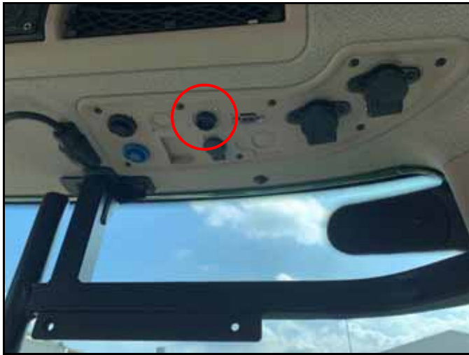
FIGURE 18. ISOBUS and Power Connector