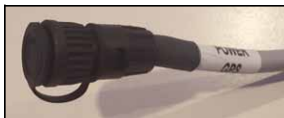
FIGURE 11. Protective Cap

If the antenna is not connected, ensure that the connectors on the roof are covered with a protective cap to prevent dust and water from entering the connector.