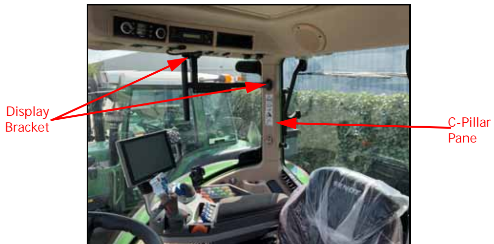
FIGURE 2. Tractor Cap Interior