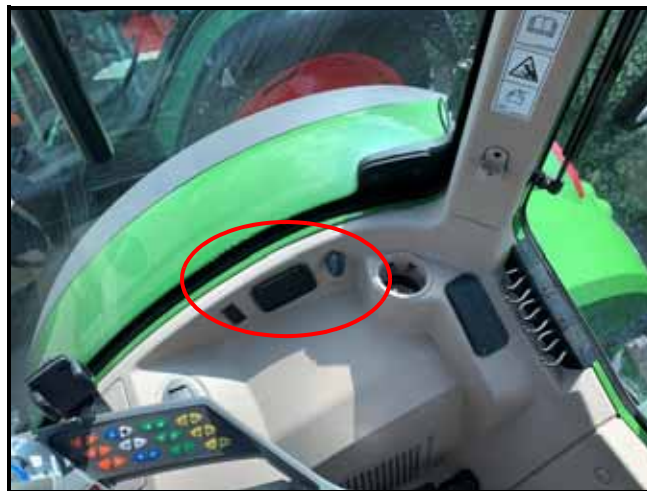
FIGURE 1. Connector Location