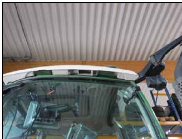
FIGURE 6. Cable Routing Location