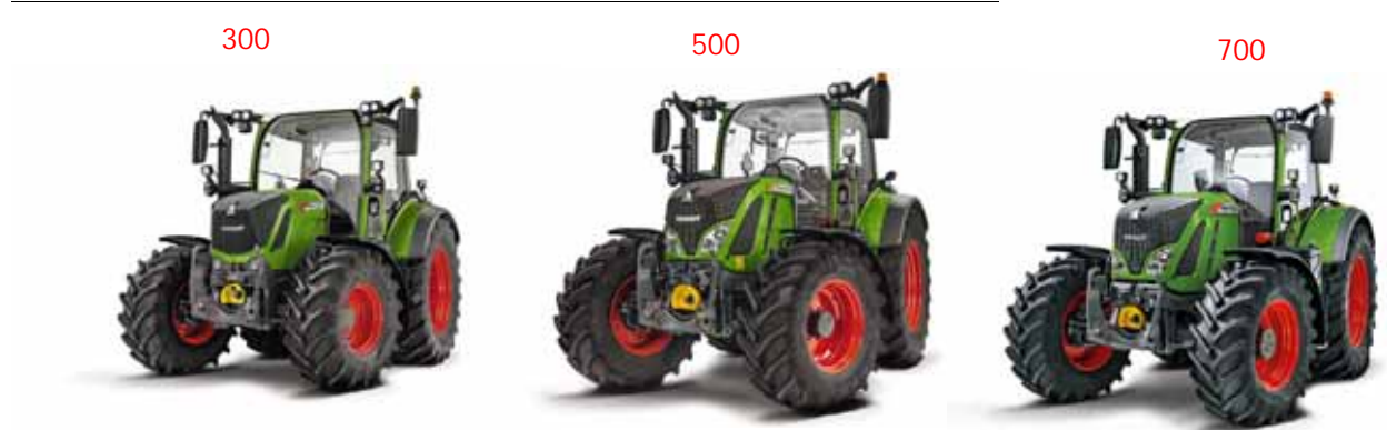
FIGURE 1. Fendt Tractors

Model. 300, 500, 700 Series - Varioguide Ready