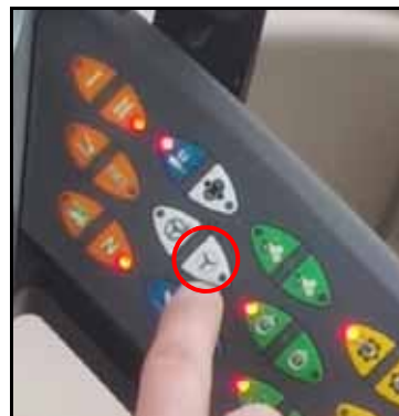
FIGURE 19. Pre-Activation on Armrest