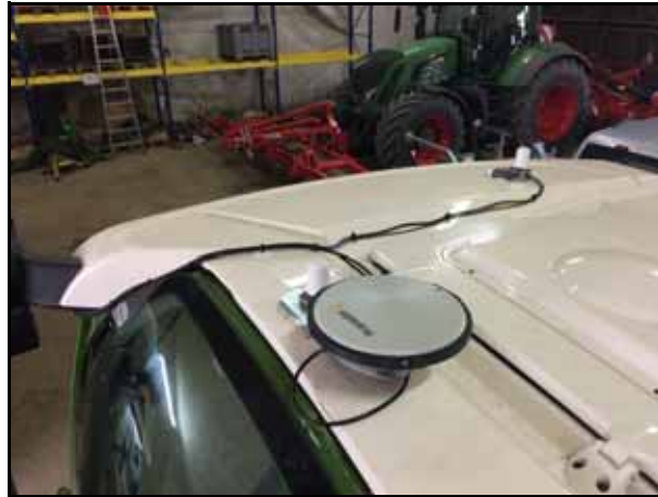
FIGURE 14. GPS Patch Antenna and Two GPRS/UMTS Antennas

If a standard GPS antenna bracket is mounted, one of the GPRS/UMTS antennas should be mounted on this bracket. The second GPRS/UMTS antenna should be mounted on a metal bracket on the cabin.