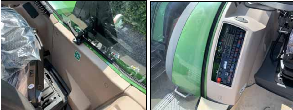
FIGURE 3. Panel Cover