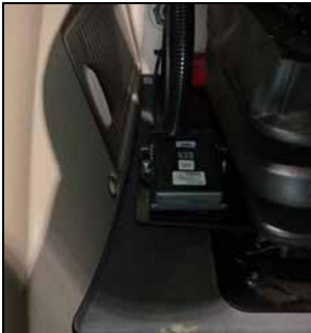
FIGURE 8. SC1 Mounted Next to Seat