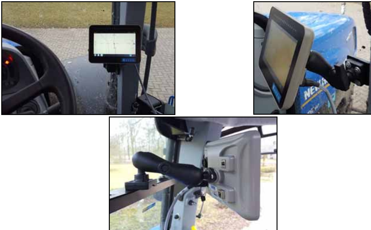
FIGURE 17. CR12 Mounted in Various Positions