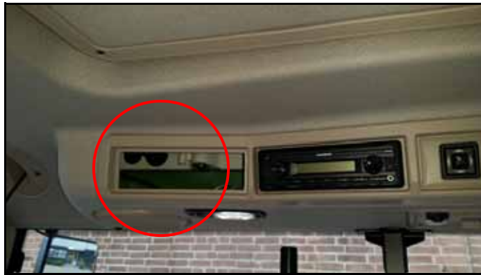
FIGURE 5. Ports to Outside of Cab