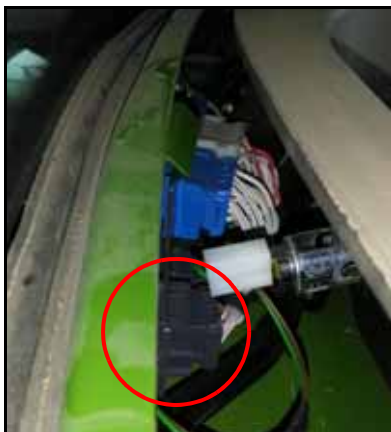
FIGURE 7. Fendt Connector