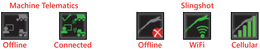
FIGURE 3. Viper 4+ Status Icons

Status indicators shown in the upper, right corner of the Viper 4+ home screen will show if the Viper 4+ is successfully communicating with the machine and with Slingshot. Green indicates successful communication, and gray indicates unsuccessful communication.