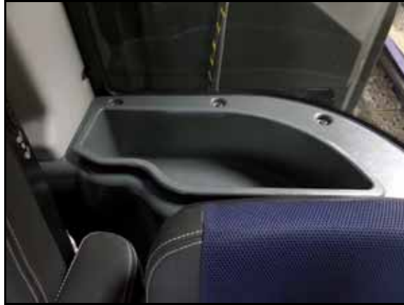
FIGURE 6. Plastic Compartment Behind Buddy Seat