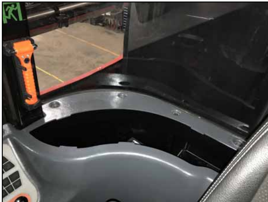
FIGURE 3. Storage Compartment Removed