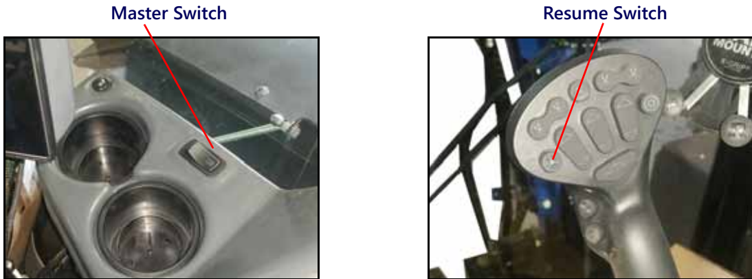
FIGURE 8. Master Switch and Resume Switch

Refer to the SC1 Calibration and Operation Manual (P/N 016-4010-005) for instructions on configuring, calibrating, and operating SC1. Please note the location of the master switch and the resume switch on the machine because they are needed for operation.