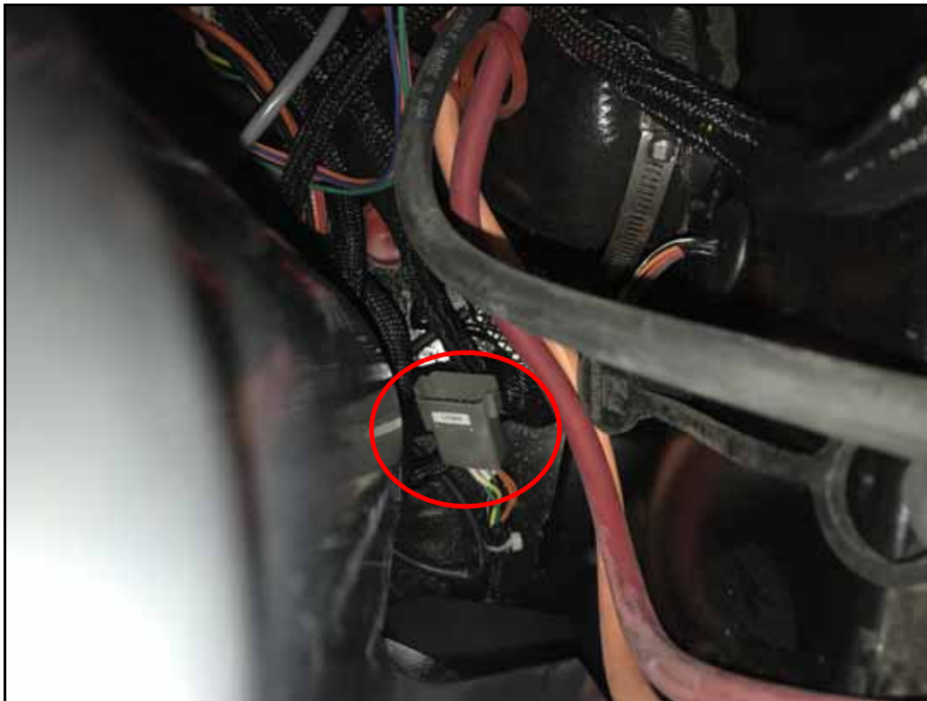
FIGURE 7. LC064 Connection