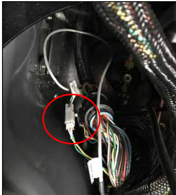
FIGURE 5. UC802 Connection