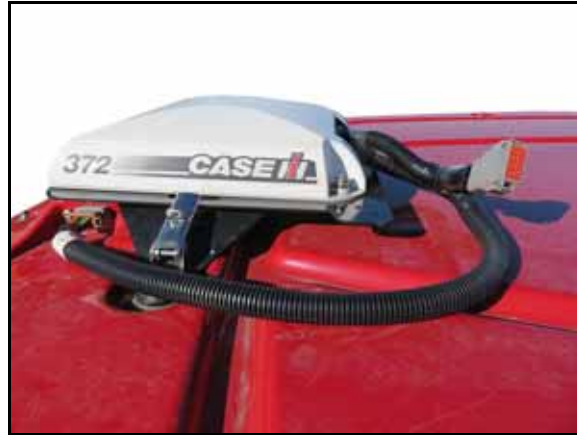
FIGURE 2. GPS Receiver Adapter Cable Connection