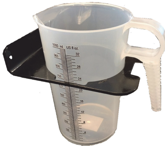
FIGURE 2. Proper Pitcher Orientation