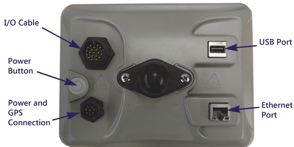
FIGURE 1. Back of CR7

The image below shows the connections on the back of the CR7 that will be used for installation. Please note that, depending on machine configuration, some of these connections may not be used.